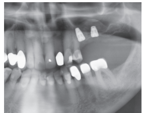
Fig. 4: PROGRESSIVE-LINE implant placed in posterior maxilla with simultaneous sinus lift

CONELOG implants are available with two different outer macro-designs: SCREW-LINE and PROGRESSIVE-LINE. The PROGRESSIVE-LINE implants have a conically shaped apical area and buttress threads to develop high initial stability. In the coronal area, a crestal anchoring thread gives support for optimal hold with limited bone height, e.g. in sinus lift procedures (Fig. 4).