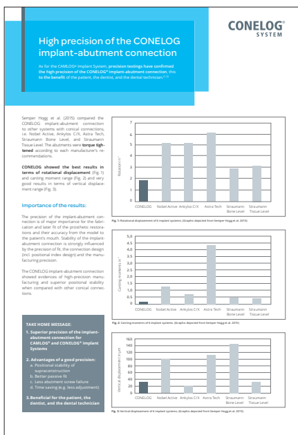
Fig. 2: Precision of different conical connections: See White paper X.J7777.09/2020.

The solid documentation of the CONELOG implant system is based on scientific evidence. This is an important contribution to Camlog's success story. The long-term data of the Promote surface, the use of platform switching, the positioning, and the stability of the implant-abutment connection are key factors contributing to the excellent performance of CONELOG implants in clinical practice. Continuous developments of the system satisfying modern treatment options are going hand in hand with clinical evidence.